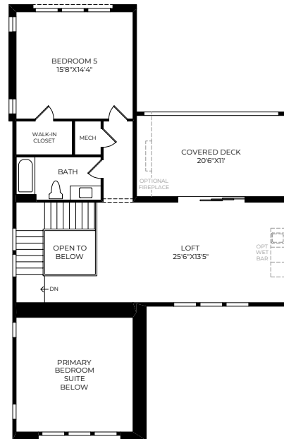
THIRD FLOOR 9' CEILING HEIGHT

Approx. 3,711+ sq. ft. | 5-7 Beds | 5-7 Baths | 2-Car Garage | 3-Story